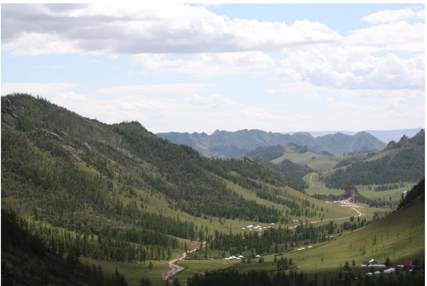
July 08, Day 3-Breakfast. 10:00AM-Drive back to Ulaanbaatar (about 70km/44miles, 2hours drive, depending on the traffic at the entrance to Ulaanbaatar). Next, visit the New Museum "Genghis Kan" ("Chinggis Khaan"), finally opened in Octubre 11, 2022. The museum is designed to show the history of the Mongol kings from the reign of King Hunnu Modun Shanyu to the abdication of the Eighth Jebtsundamba. Lunch is included in local restaurant in Ulaanbaatar. Transfer to the hotel (*the rooms can be used after 2:00 p.m. on the day of arrival). Overnight at selected and confirmed hotel. Dinner is not included. (B)(L)