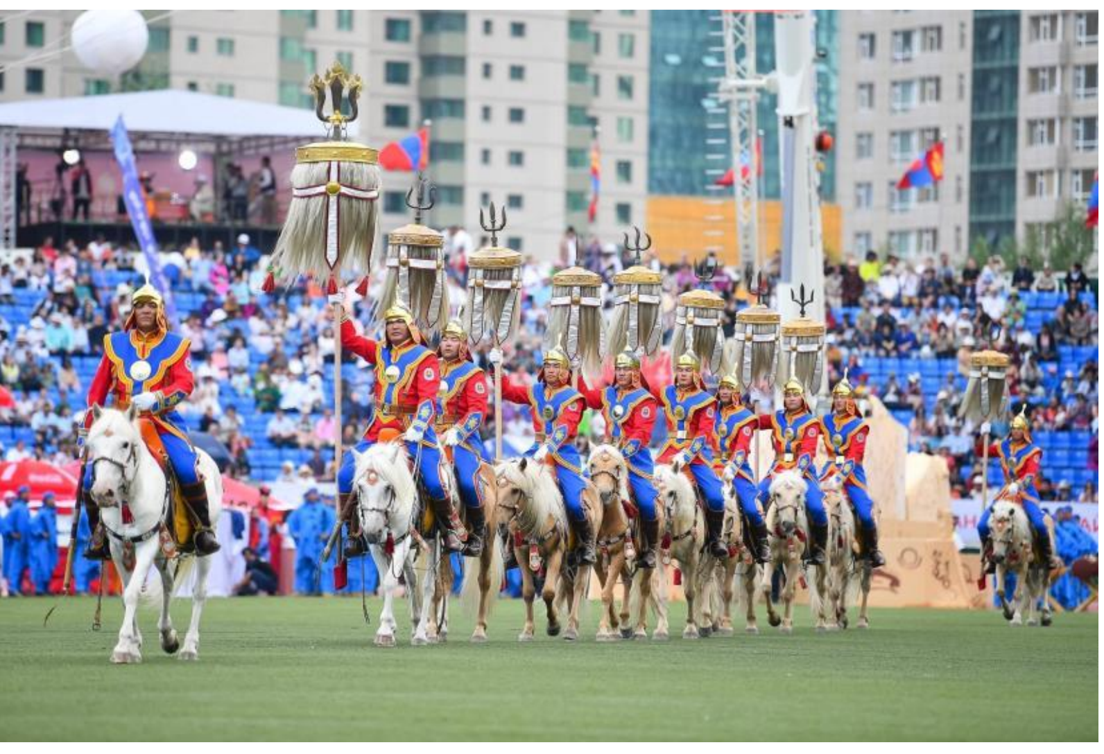
July 11, Day 6-Breakfast. 08:00AM-Meet Samar Magic Tours team at reception of the hotel. Transfer to National Sports Stadium for Naadam Festival Opening Ceremony, featuring dancers, athletes, horse riders, and musicians. After the ceremony, the competitions begin: archery and wrestling in Ulaanbaatar. Another popular Naadam activity is the playing of games using shagai, sheep knuckles that serve as game pieces and tokens of both divination and friendship. Every year 512 wrestlers compete in the National Naadam. The Nachin or Falcon title is given to a wrestler who wins 5 rounds, Zaan or Elephant is a winner of 7 rounds. The wrestler who wins all nine rounds becomes the national wrestling champion and bestowed with the title Arslan or Lion. A wrestler, who has been Lion twice, is honoured with the title of Avarga or Champion. The winner of archery is given a title Erkhiin Mergen Kharvaach that means Archer of Greatest Wisdom. Lunch is included in local restaurant. Transfer to hotel. Overnight at selected and confirmed hotel. Dinner is not included. (B)(L)