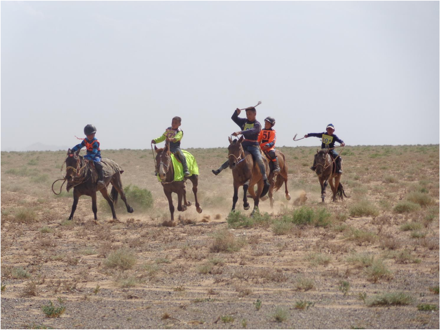
July 10, Day 10 -Breakfast. Meet Samar Magic Tours team at reception of the hotel. Drive outside of Ulaanbaatar city (about 30-35kms/19-22miles) to see the horse racing . In horse racing, horses of 6 different ages groups participate, beginning from 2 to 6-year olds. Racetracks vary according to the horses' age: In some races, more than 700 horses take part. Young children of ages 5 to 13 participate in the horse races too. The first 5 horses to finish a race are called Airagdakh which means that the horses are sprinkled with airag. The title Tumnii Ekh or Top Horse of 10,000 is given to the winning horse. Drive back to Ulaanbaatar (about 30-35kms/19-22miles). Lunch is included in local restaurant . Transfer to the hotel. Overnight at selected and confirmed hotel. Dinner is not included . (B)(L)