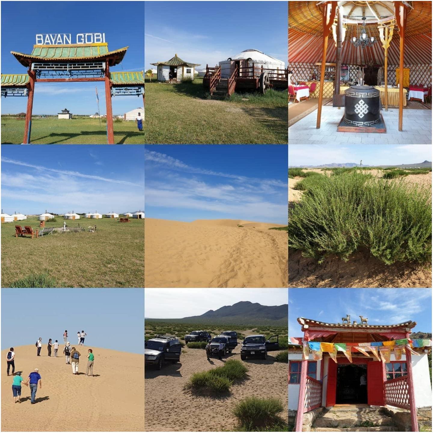
July 04, Day 4-Breakfast. Today, we will head to the west to Karakorum in Central Mongoliathe Genghis (Chinggis) Khan's 13th century capital and heart of the mighty Mongolian Empire and Okhon river Valley, cradle of Mongolian civilization. On the way,