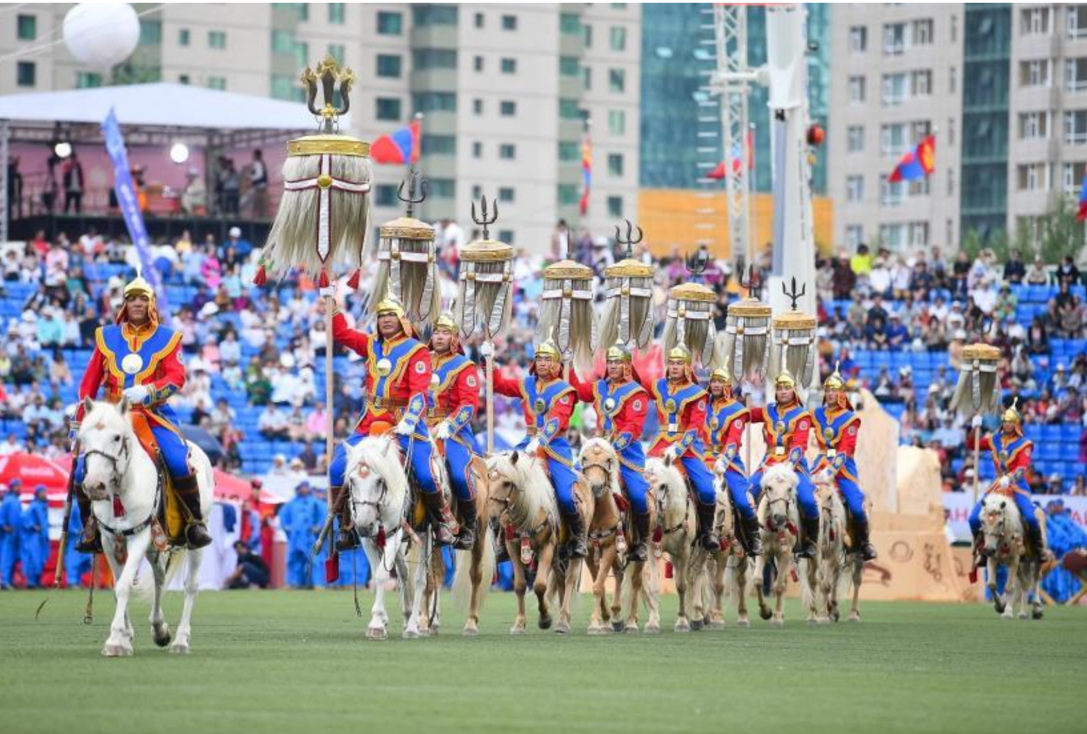
July 11, Day 11-Breakfast. 08:00AM-Meet Samar Magic Tours team at reception of the hotel. Transfer to National Sports for Naadam Festival Opening Ceremony, featuring dancers, athletes, horse riders, and musicians. After the ceremony, the competitions begin: archery and wrestling in Ulaanbaatar. Another popular Naadam activity is the playing of games using shagai, sheep knuckles that serve as game pieces and tokens of both divination and friendship. Every year 512 wrestlers compete in the National Naadam. The Nachin or Falcon title is given to a wrestler who wins 5 rounds, Zaan or Elephant is a winner of 7 rounds. The wrestler who wins all nine rounds becomes the national wrestling champion and bestowed with the title Arslan or Lion. A wrestler, who has been Lion twice, is honoured with the title of Avarga or Champion. The winner of archery is given a title Erkhiin Mergen Kharvaach that means Archer of Greatest Wisdom. Lunch is included in local restaurant. Transfer to hotel. Overnight at selected and confirmed hotel. Dinner is not included. (B)(L)