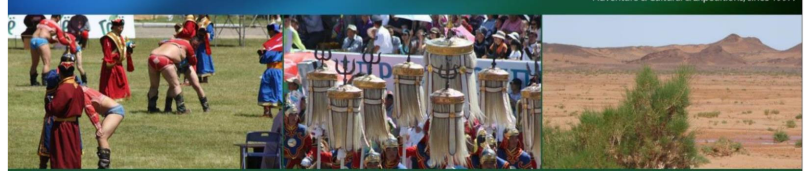
We visit the Ornithological local museum for observation. Continuous drive further to Karakorum (about 80 km/50 miles). Overnight in Tourist Gers Camp in Karakorum . (B)(L)(D)