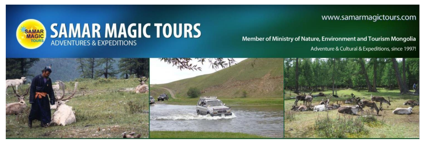
of the beautiful alpine lake to the west and volcanic lava flows to the east will open in front of you. Explore the area on foot. Overnight in tourist Gers camp. (B)(L)(D)