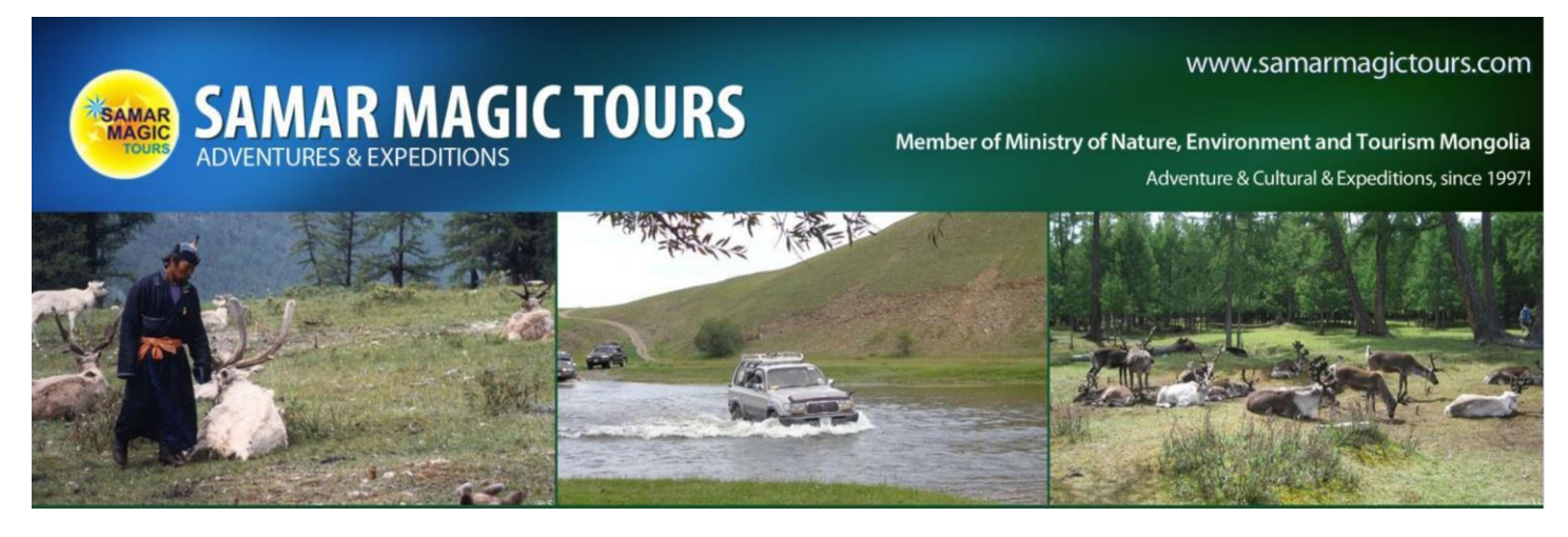
Day 5-Breakfast. A free day and relaxation in Khuvsgul Lake National Park. Enjoy the view of the beautiful lake Khovsgol, a crystal clear water lake that stretches over 100 miles. Explore the area on foot. See a Tsaataan (Reindeer) people. Optional activities such as ride on a reindeer, ride horses on the steppes, fishing, boating, sauna, etc (extra payment on site!). Overnight in tourist Gers camp. (B)(L)(D)