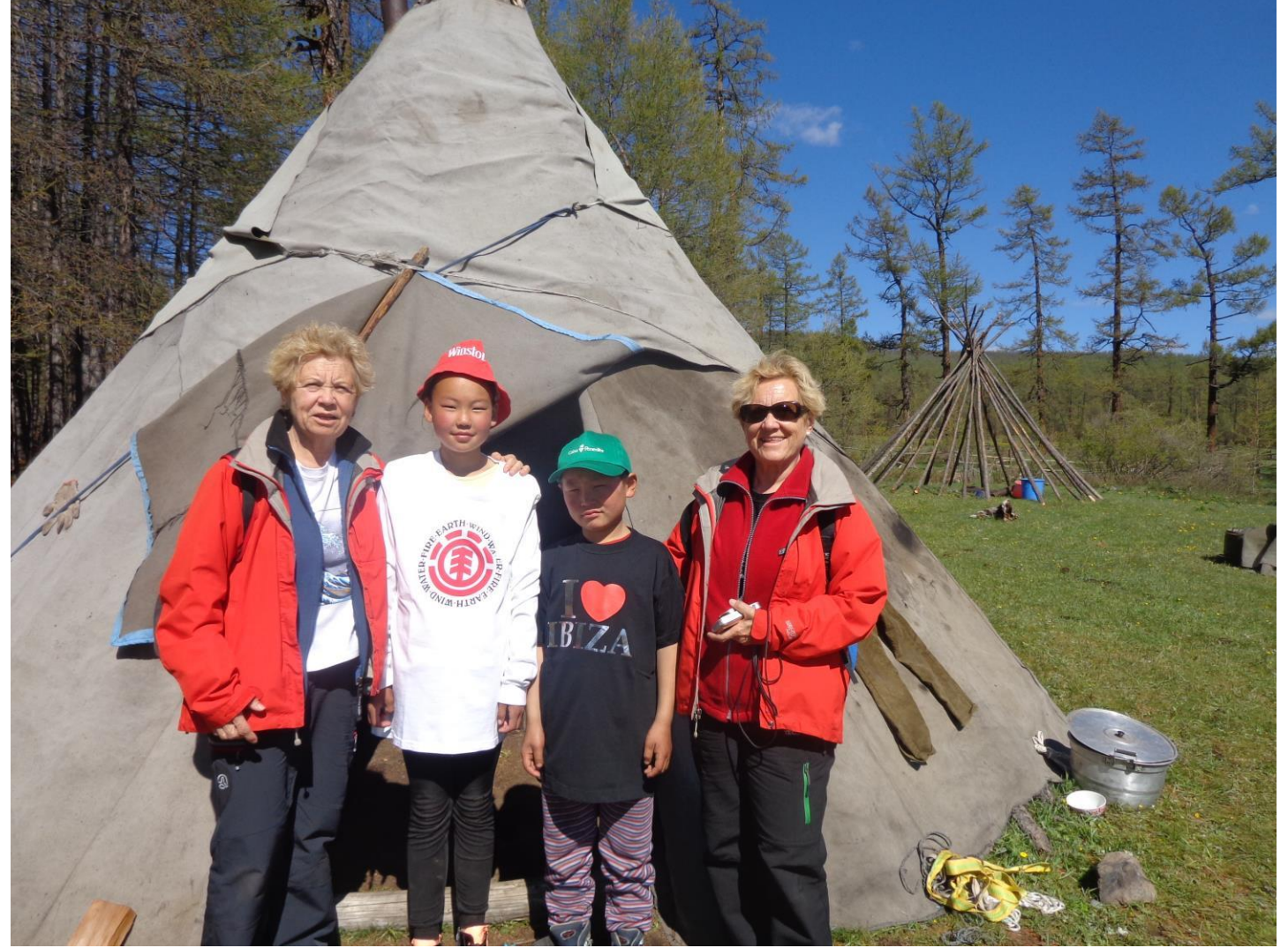
DAY BY DAY ITINERARY:

Day 1-Upon your arrival in Ulaanbaatar Genghis Khan New Airport and after custom formalities and baggage claim, you will be met by Samar Magic Tours team and taken to the centrally located hotel in Ulaanbaatar (by hotels policy the check-in time is after 02:00PM/14:00). Ulaanbaatar City Grand Tour: visit the Gandantegchinlen Monastery is a Tibetan-style Buddhist monastery that has been restored and revitalized since 1990. The Tibetan name translates to the "Great Place of Complete Joy". It currently has over 150 monks in residence. It features a 26.5-meter-high statue of Avalokitesvara. It came under state protection in 1994. Here you will have the opportunity to attend a Buddhist ceremony. Next, we will visit a small museum of dinosaur fossils. The centerpiece of the museum is the 4m tall, 3 tonne UV light Tarbosaurus bataar (cousin of Tyrannosaurus rex) and a smaller Saurolophus, with its distinctive skull crest. The Tarbosaurus bataar made international headlines in 2012, when it sold for more than US$1 million at auction in Texas. The Mongolian government protested that the fossil had been illegally removed from Mongolia and demanded its return. The legal battle ended when a US judge ruled in favor of