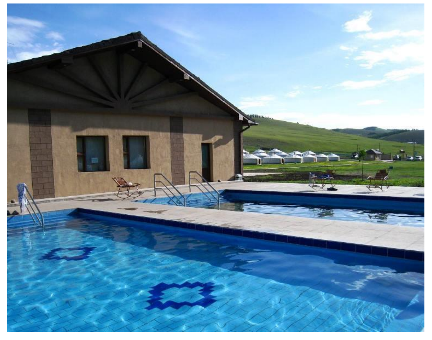
Day 8-Breakfast. Meet Samar Magic Tours team. A long drive towards via Tsetserleg city to reach Tsenkher Hot Springs, situated in a mountain meadow. Relaxing and enjoy baths at Tsenkher Hot Spa (89C/192.2F). Visit a Yak breeder's family and experience the traditional customs and lifestyle of local residents. Overnight in tourist Gers camp. (B)(L)(D)