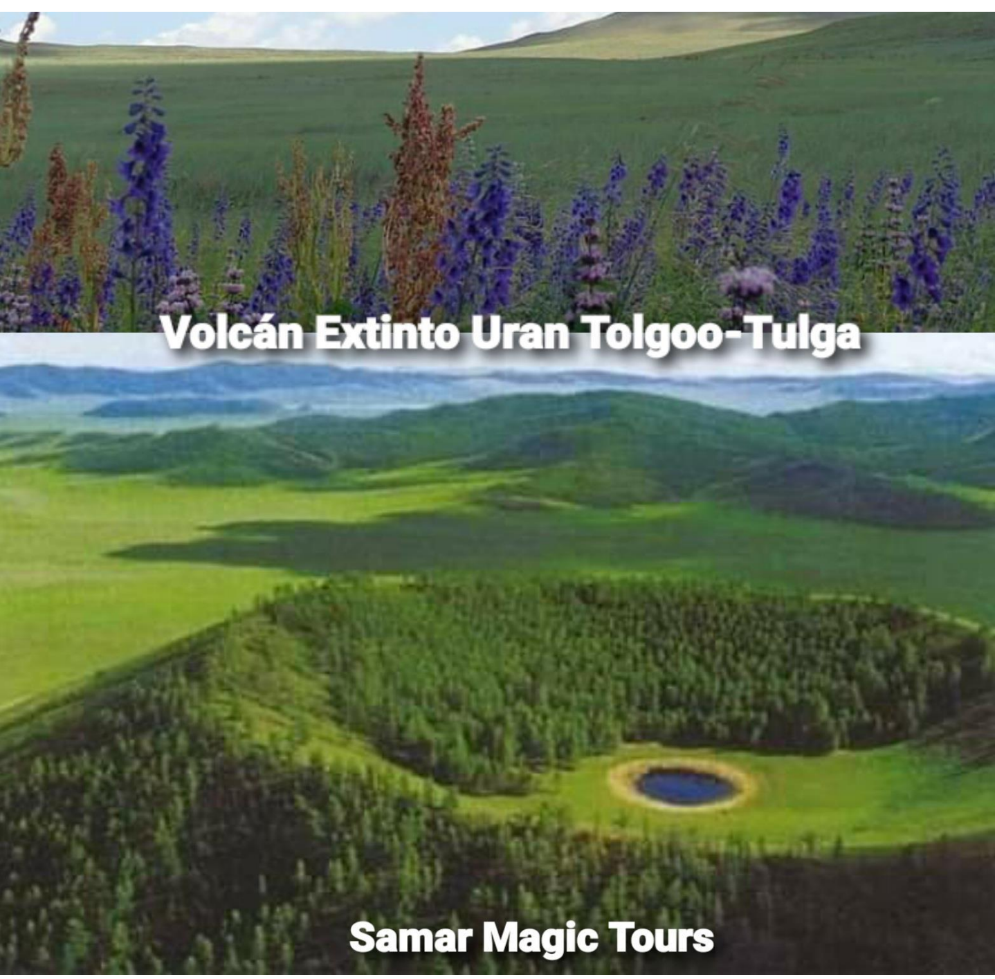
Day 3-Breakfast. Meet Samar Magic Tours team. Next, drive towards to Uran-Togoo Tulga Uul Natural Park in Bulgan province. Explore the area of Uran extinct volcano on foot. This area has been protected as a "Natural Monument" since 1965, and covers 58 square km. The protected area is the home of numerous kinds of rare animals. Uran extinct volcano is at an elevation of 1,686 meters above sea level. On