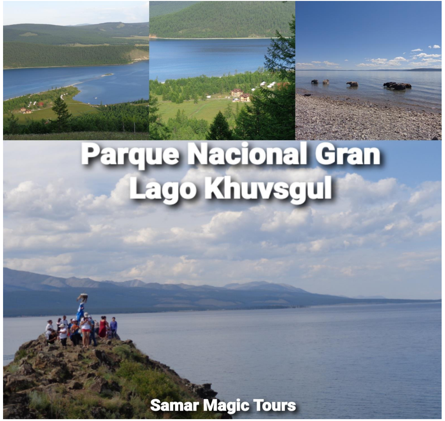
Day 4-Breakfast. Meet Samar Magic Tours team. A long trip via Murun towards to the Great Lake Khuvsgul National Park-known as blue pearl of Mongolia, located close to the Siberian border. Stop in-route in the Valley of Kings for the display of the ancient burial grounds of the Turkic nobles and a view of the carved "Deer Stones". Khuvsgul is the second largest freshwater lake in