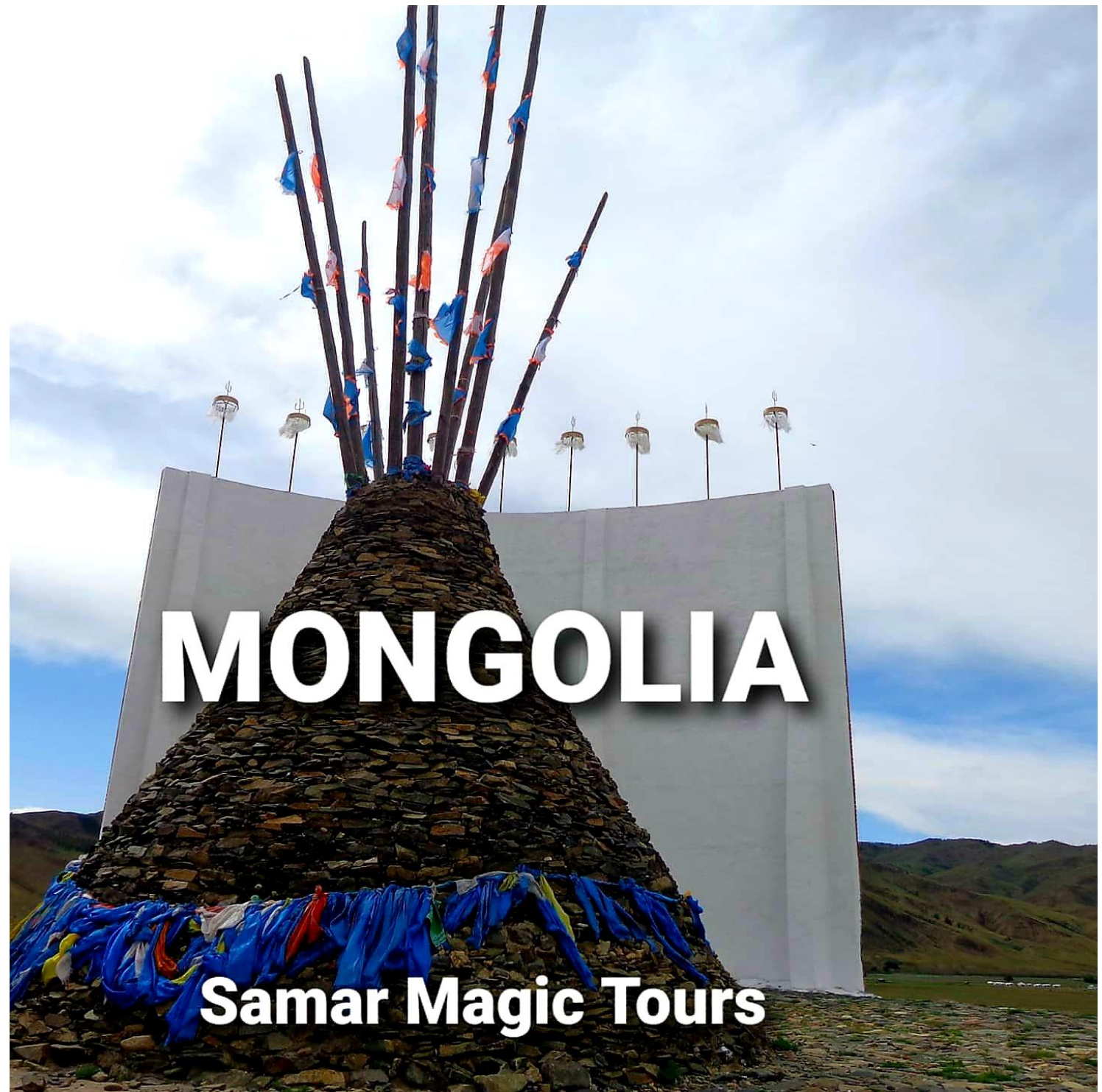
1. First, there was the Xiongnu Empire, a confederation of nomadic tribes that lived on the steppes from about the 3rd century BC. until the 1st century AD.