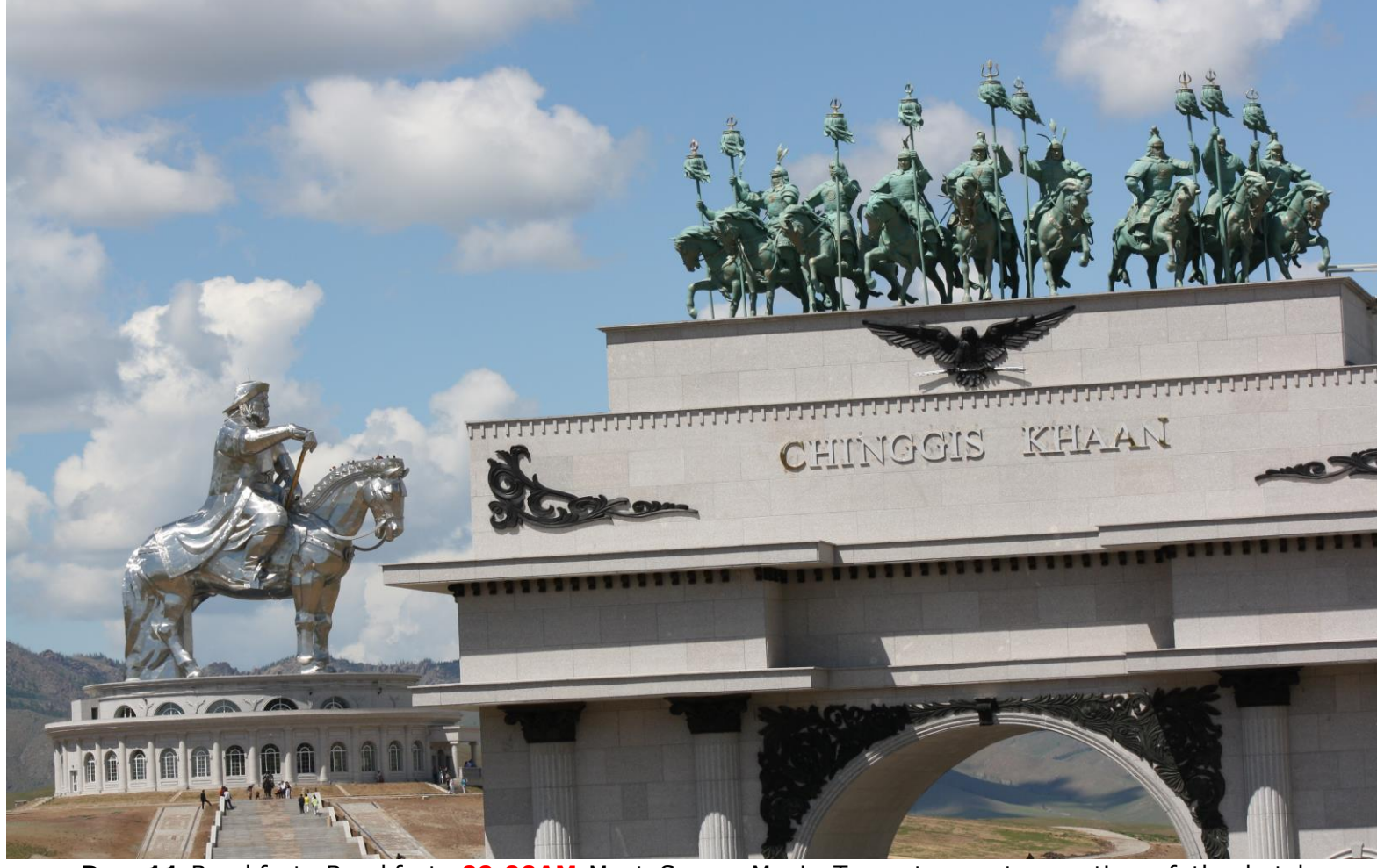
Day 11-Breakfast. Breakfast. 09:00AM-Meet Samar Magic Tours team at reception of the hotel. Drive towards to visit the 40meter /~133,3 feet Genghis Khan Statue on horseback (55km/34miles) N/E of the Mongolian capital Ulaanbaatar. The statue is symbolically pointed east towards his birthplace. It is on top of the Genghis Khan Statue Complex, a visitor center, itself 10 meters (32 ft 10 in) tall, with 36 columns representing the 36 khans from Genghis to Ligdan Khan. Visitors walk to the head of the horse through its chest and neck of the horse, where they can have a panoramic view. Near the Great Statue of Genghis Khan, we can take beautiful photos with the Kazakhs and their Golden Eagles, rides on the backs of Bactrian camels, or rides on Mongolian horses through the steppes, shooting with a bow and arrow (*extra payment at the same place). Mongolian lunch is included on the way. After, continuous drive north further to reach Gorkhi/Terelj National Park (50km/31miles). Seeing grasslands and beautiful vistas. The valley is about 20kms/12miles long at 1600m. This picturesque National Park is a part of Khan Khentii Strictly Protected Area. It is a great place for hiking, trekking, even you can rock climb here at its natural steep granite walls. Explore the Turtle shaped original giant rock - symbol of Gorkhi/Terelj National Park. Drive back to Ulaanbaatar (70km/44miles). Last Shopping for souvenirs and cashmere. Transfer to hotel. Overnight at selected and confirmed hotel. Dinner is not included. (B)(L)