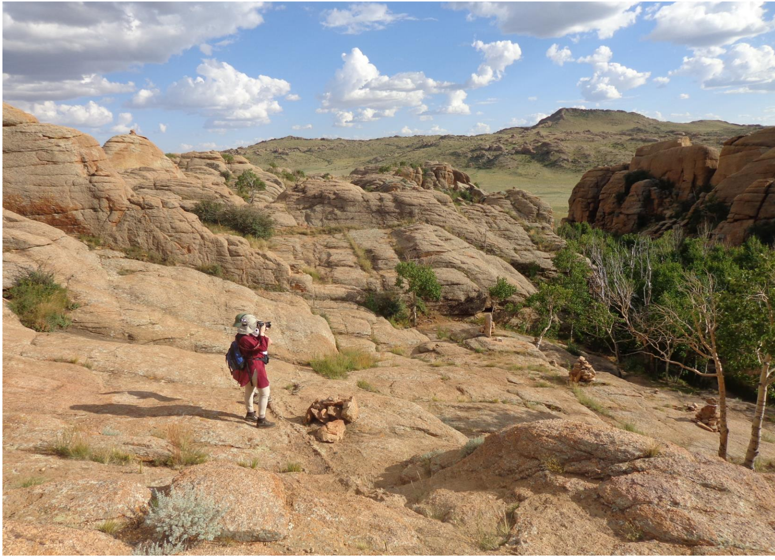
Day 3 -Breakfast. Meet Samar Magic Tours team at reception of the hotel. Drive towards south to Baga Gazariin Chuluu Rock Formations – located in Delgertsogt sum, Dundgovi province and surrounded by plain. The highest one is 15 km long and 10 km wide granite stone-mountain elevated at 1768m above sea level. You will see rocks and stones in unique shapes and buries of Mongols from Middle Ages. Today, we explore the ruins of Sum Khukh Burd Temple . It was built in the 10th century from rocks transported from over 300kms/187 miles away. Accommodation in tourist Gers camp. (B)(L)(D)