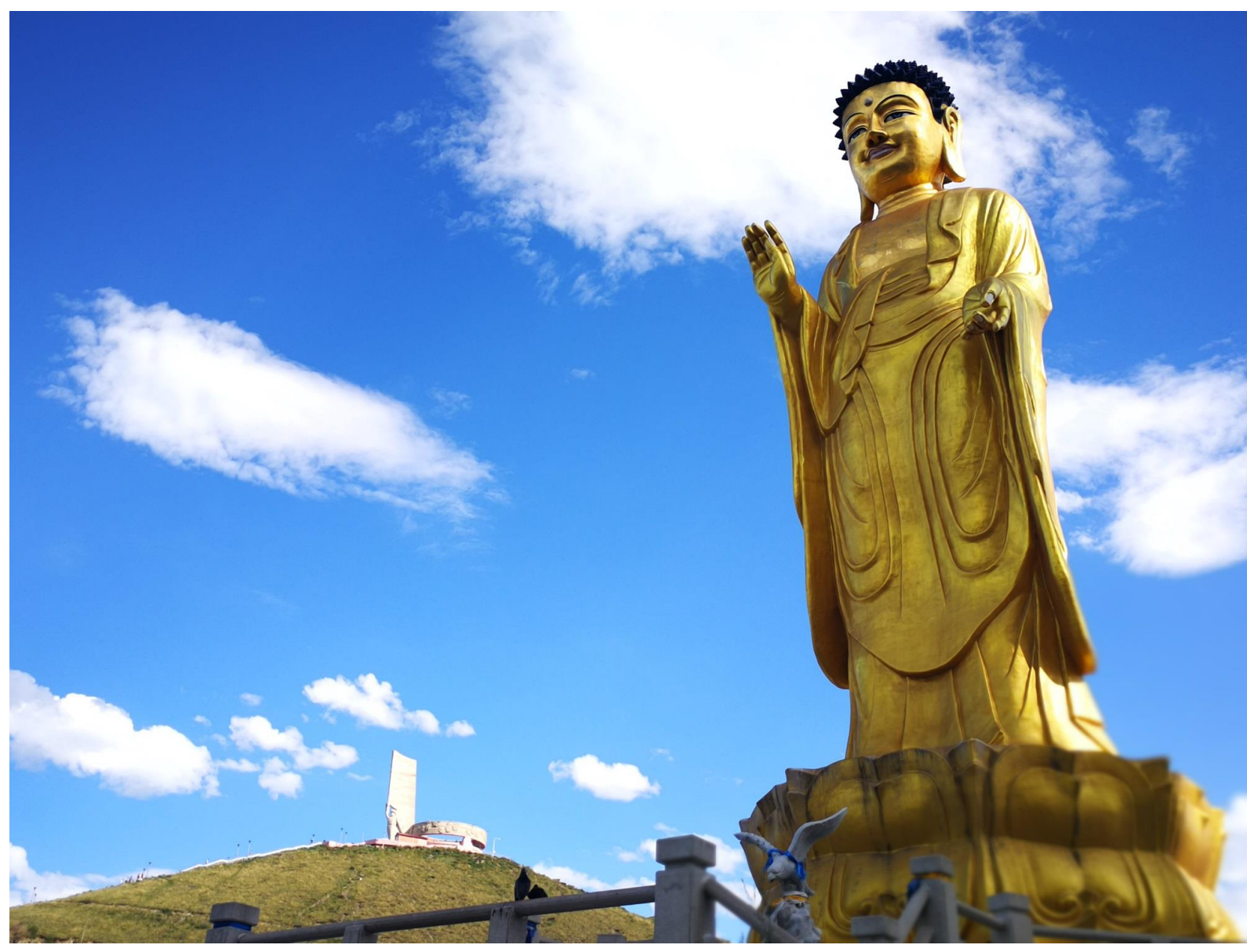
Day 9 -Breakfast. 10:00AM -Meet Samar Magic Tours team at reception of the hotel. Next, visit Zaisan Hill, which offers an overview of Ulaanbaatar. Next, we will visit the Buddha statue , located at the base of the 75-foot-tall (23-meter-high) Zaisan Memorial . Below the statue is a