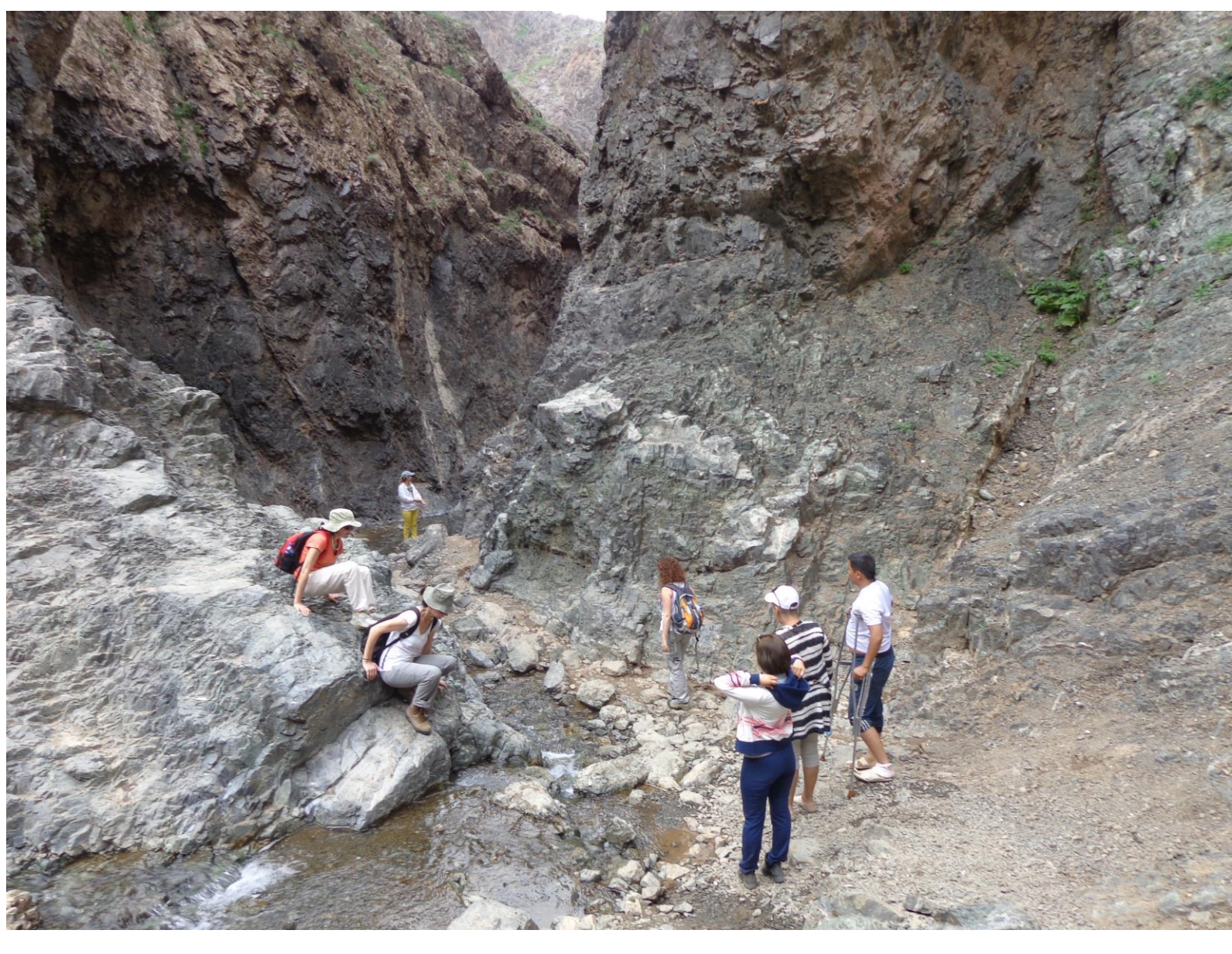
Day 5-Breakfast. Meet Samar Magic Tours team. Drive to Gobi Desert in South Gobi province. Explore Yolin Canyon on foot in Gobi Gurvansaikhan National Park-was established in 1993, and expanded to its current size in 2000. This is the largest national park in Mongolia. Famed for its rich bird habitat, Yolin Canyon or commonly known as (Vulture's Gorge) was originally established as a bird preserve and later for its stunning beauty and great hiking options Yolin Canyon became one of the major destinations in Gobi. Here you will have the opportunity for hiking in the ice valley of Gobi, the stunning landscapes. There is a small museum, which displays dinosaur eggs, some bones and stuffed birds and leopards. Overnight in tourist Gers camp. (B)(L)(D)