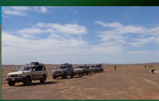
Day 6-Breakfast. Meet Samar Magic Tours team. Drive towards to the Largest Khongor Sand dunes. Exploration and enjoy and climb up. Visit an authentic camel breeding family. See their real nomadic life and ride two humped camels around. Overnight in tourist Gers camp. (B)(L)(D)

Day 7-Breakfast. Meet Samar Magic Tours team. Drive towards to Bayanzag (Rich in Saxual) or Flaming Cliffs in Gobi desert. Explore Bayanzag (Rich in Saxual) or Flaming Cliffshere Roy Chapman Andrews, an American palaeontologist and staff of the Museum of Natural History in New York first found 4-6 inches dinosaur eggs here in 1922. Bayanzag is referred as Flaming Cliffs for its amazing colours and shape). Enjoy the Gobi sunset at the legendary "Flaming Cliffs," which glow brilliantly at sunrise and sunset. Overnight in tourist Gers camp. (B)(L)(D)